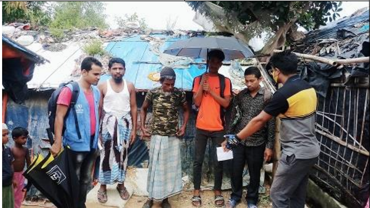
9: Sub- Block No. B-East, FCN: 101690 ID: EMCRP_WD_07B_DTTW_2E.9