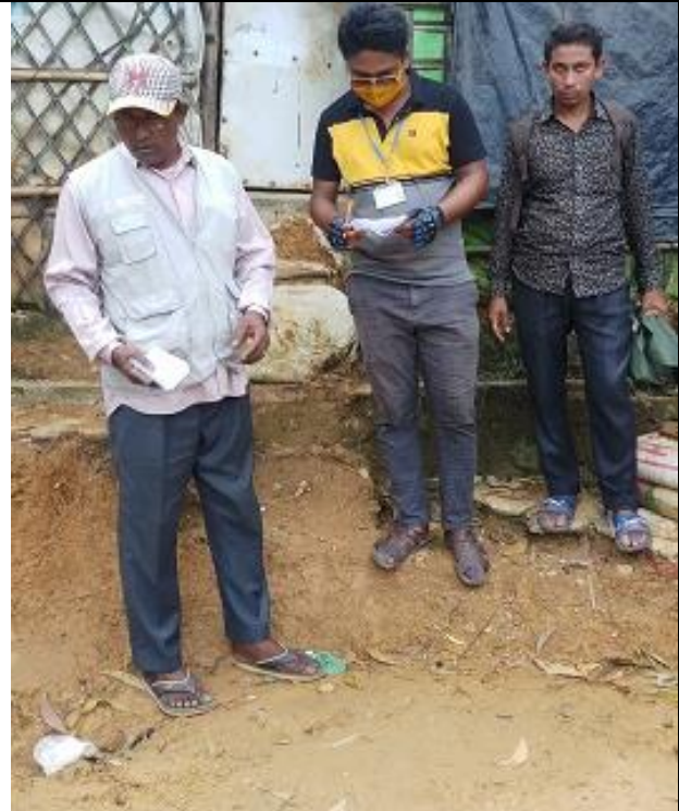
4: Sub- Block No. B-East, FCN: 107956 ID: EMCRP_WD_07B_DTTW_2E.4