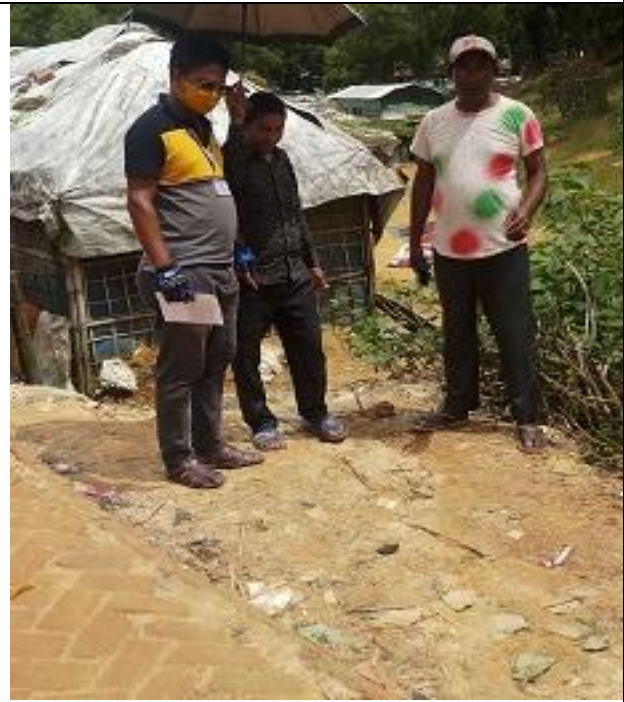
6: Sub- Block No. B- W/C, FCN: 125831 ID: EMCRP_WD_07B_DTTW_2E.6