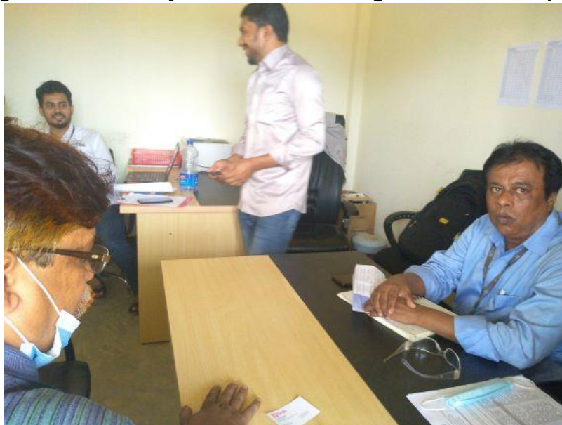
Figure-02: Meeting with Site Management (BRAC).