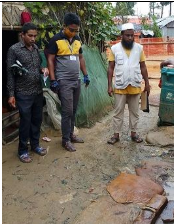
1: Sub- Block No. A, FCN: 126212 ID: EMCRP_WD_07B_DTTW_2E.1

Within the Deep Tara Tube Well areas health post, mosque, madrasa, food distribution center, learning center, CiC office and information center is identified. However, none is going to be affected due to project intervention. No significant environmental or social disturbance is anticipated due to construction activities. In this scheme area, no elephant migration routes exist (ref. IUCN). Elephant migration routes are within 1km of recorded elephant movement locations (Map-3).