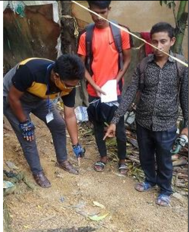
8: Sub- Block No. A, FCN: 107916 ID: EMCRP_WD_07B_DTTW_2E.8