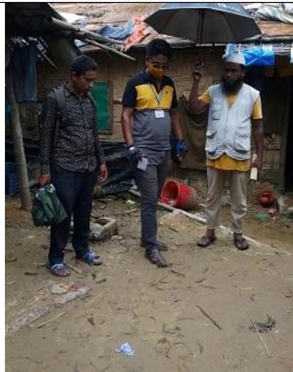
2: Sub- Block No. A, FCN: 106951 ID: EMCRP_WD_07B_DTTW_2E.2