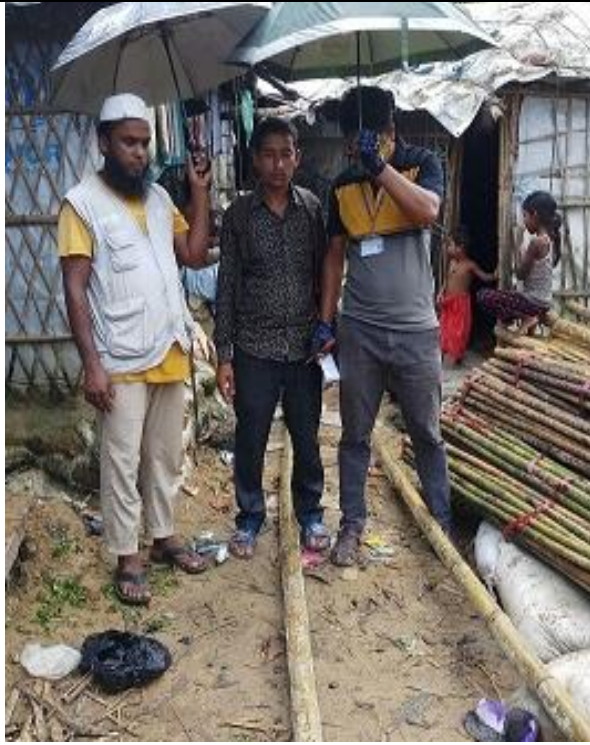
3: Sub- Block No. A, FCN: 148140 ID: EMCRP_WD_07B_DTTW_2E.3