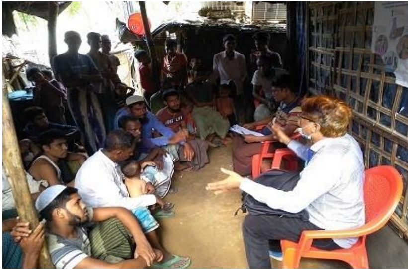
Figure-1: Community Consultation Meeting on DTTW at Camp-2E