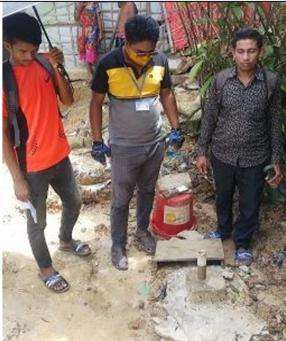
5: Sub- Block-East, FCN: 126763 ID: EMCRP_WD_07B_DTTW_2E.5