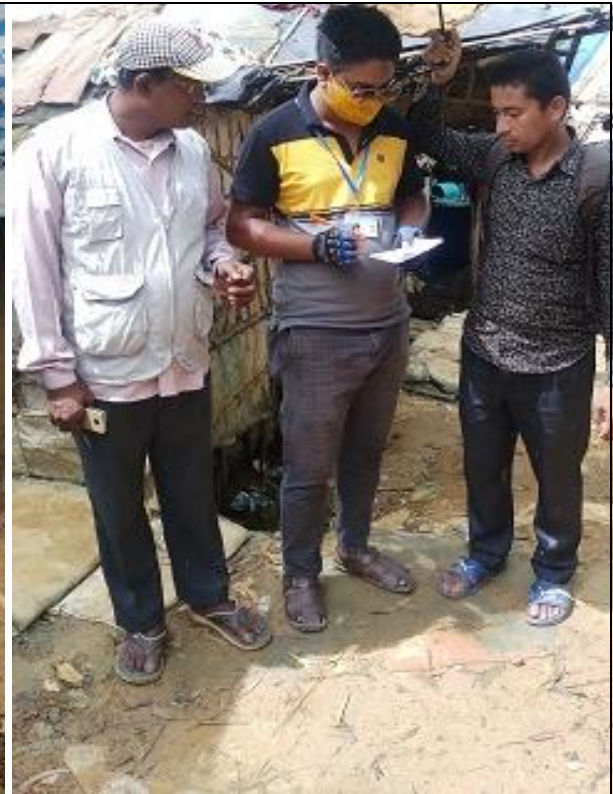
11: Sub- Block No. C, FCN: 134631 ID: EMCRP_WD_07B_DTTW_2E.11