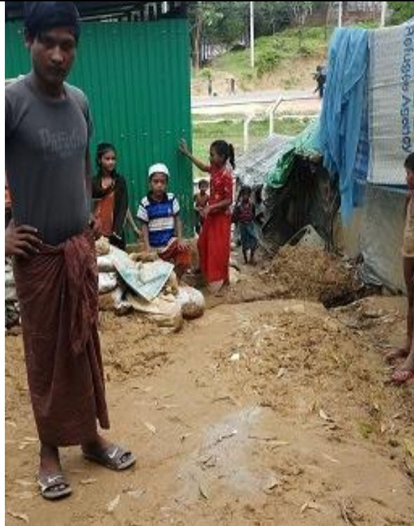
7: Sub- Block _ B-W/C, FCN: 131024 ID: EMCRP_WD_07B_DTTW_2E.7