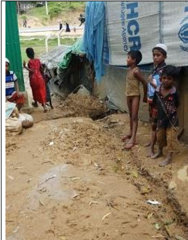
10: Sub- Block _B-W/C, FCN: 128146 ID: EMCRP_WD_07B_DTTW_2E.10