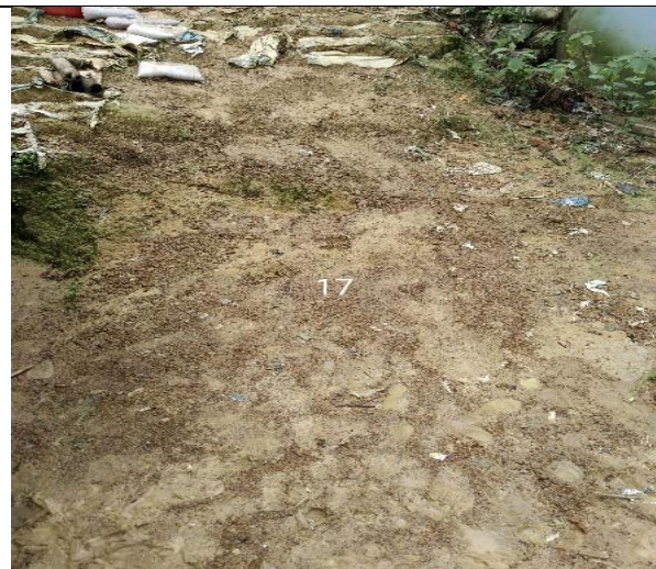
6. Block EG-2