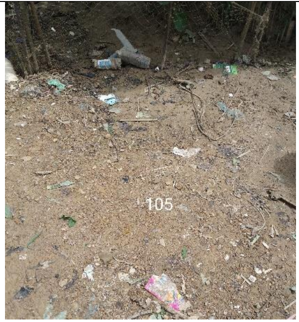
2. Block EE-6