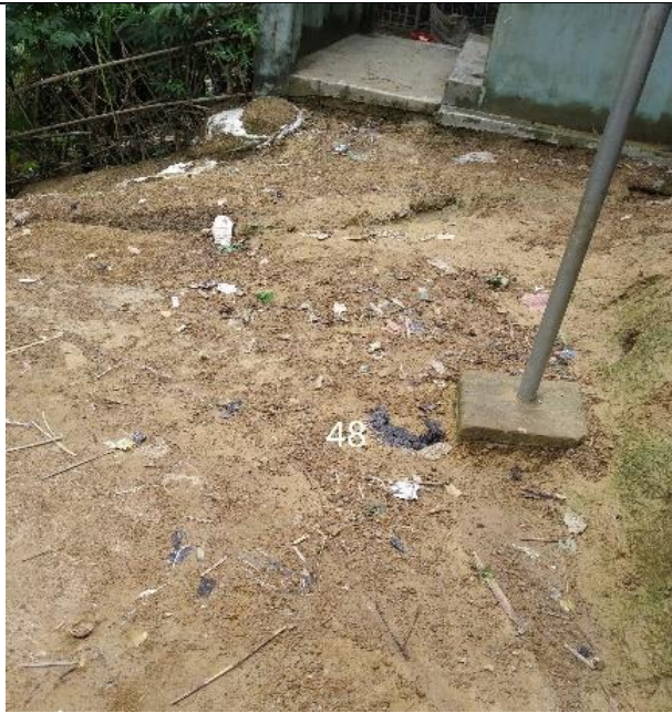
1. Block DE-3