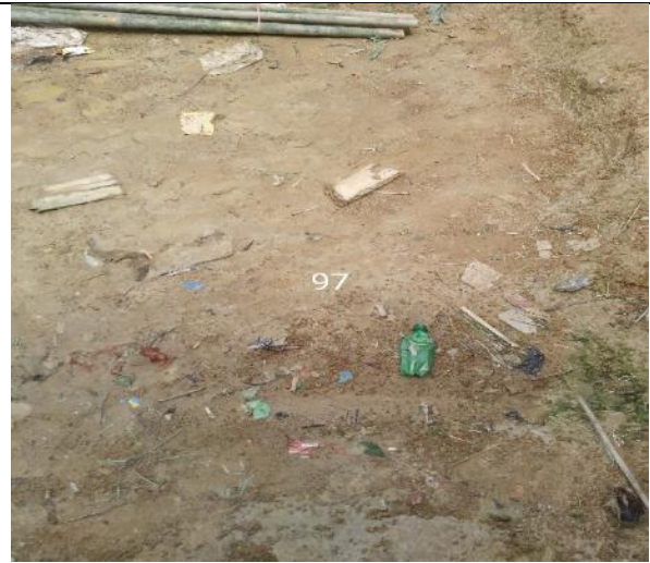
4. Block EE-6