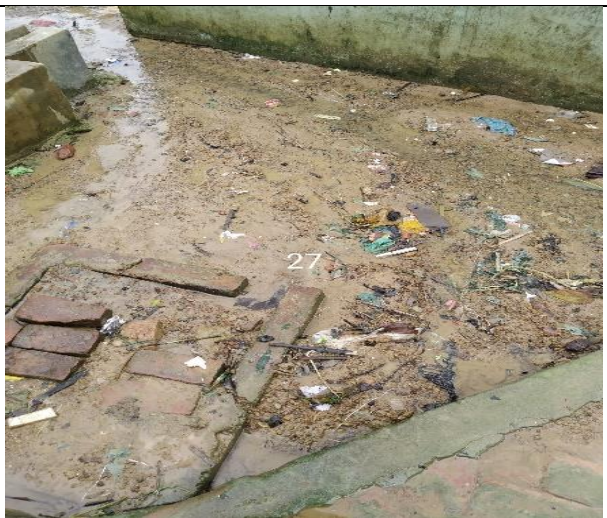
5. Block G-61