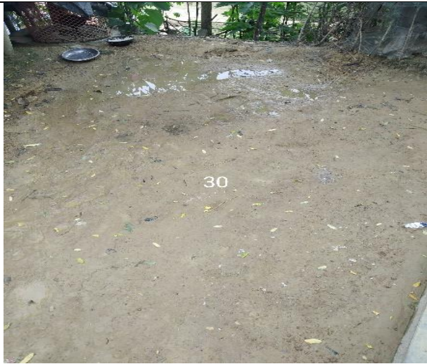
3. Block G-53