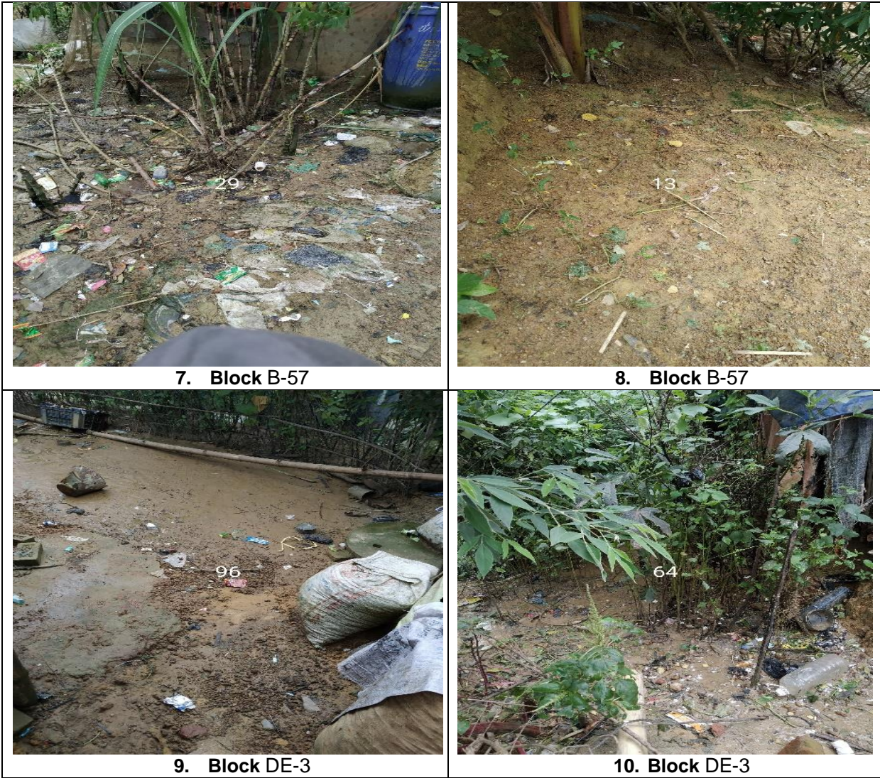
Figure-1: Proposed Deep Tara Tube well sites at Camp-05