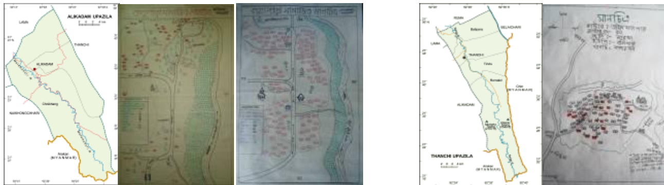
Map of Ailmara para of ThanchiUpazila

Babupara and Noyapara villages of AlikadamUpazila and Ailmara village of ThanchiUpazila of Bandarban district.