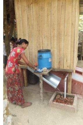
Hand washing device

Hand washing device: Low cost hand washing device has been prepared for hand wash after anal cleansing work by using locally available materials.