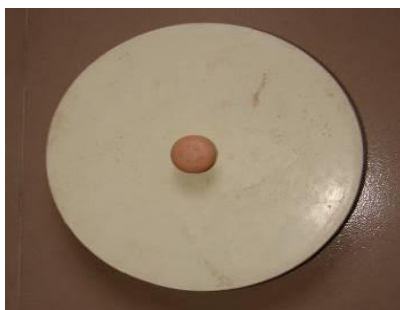
Pan Cover Handle

Pre cast slab with Eco-pan: Two types of pre-cast slab were prepared to reduce the slab thickness and construction cost as well as developing entrepreneurship that will make the availability of eco-toilet construction materials in local level.