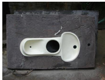
Pre cast slab with Eco-pan