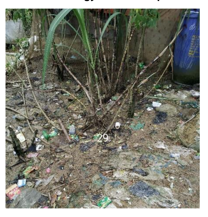
Environmental and Social Screening Report